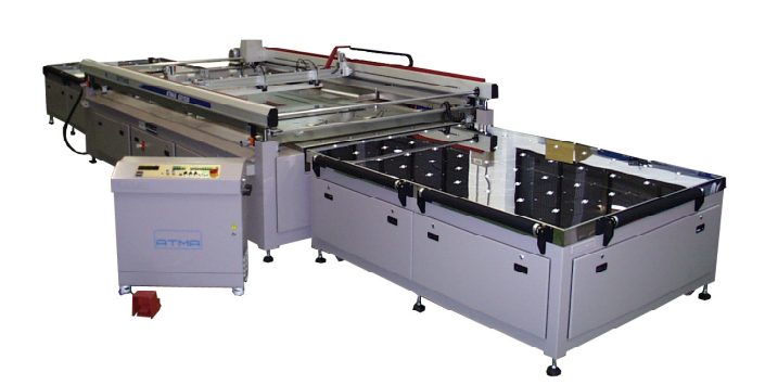
ATMA GS2040 Semi-Automatic Flat Glass Screen Printer