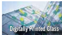
Digitally Printed Glass

HDC HIGH DEFINITION GLASS FOR ARCHITECTURE