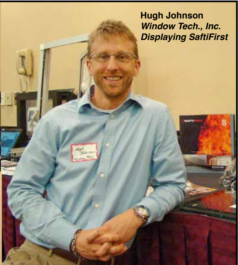
Hugh Johnson Window Tech., Inc. Displaying SaftiFirst