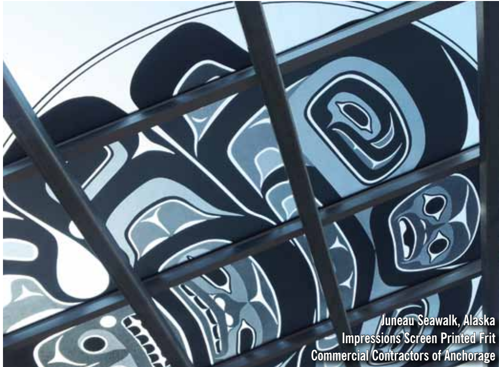
Juneau Seawalk, Alaska Impressions Screen Printed Frit Commercial Contractors of Anchorage