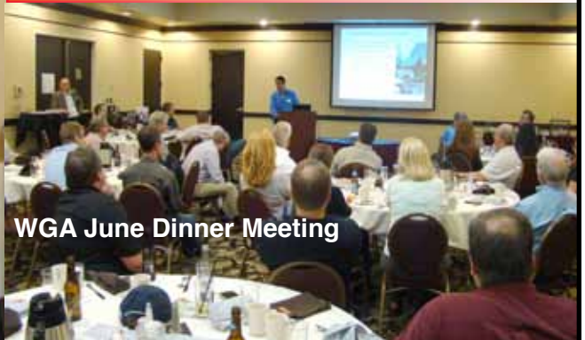
WGA June Dinner Meeting

See page 9 for more pictures of our June Dinner Meeting WGA Displayers.