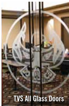
TVS All Glass Doors

HDC HIGH DEFINITION GLASS FOR ARCHITECTURE