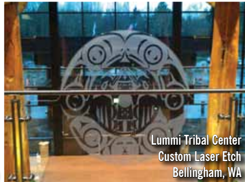
Lummi Tribal Center Custom Laser Etch Bellingham, WA